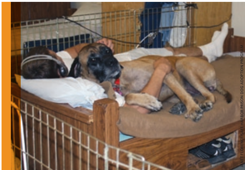
Gidget, a dog in the Safe Harbor Prison Dog Program, relaxes with her handler at Lansing Correctional Facility in Kansas.