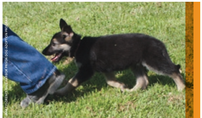
Inmates at Lansing Correctional Facility in Kansas socialize and train dogs like Roxanne through the Safe Harbor Prison Dog Program.

When the rioting started, inmates led the dogs out of their dormitory on leashes, had them lie down, then lay on top of them to protect them from the smoke from the fires