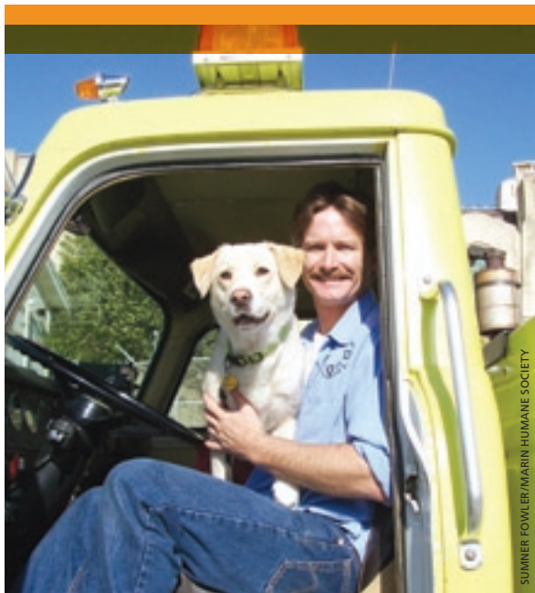
Inmate firefighters at San Quentin State Prison in California train and socialize dogs through a partnership with the Marin Humane Society.